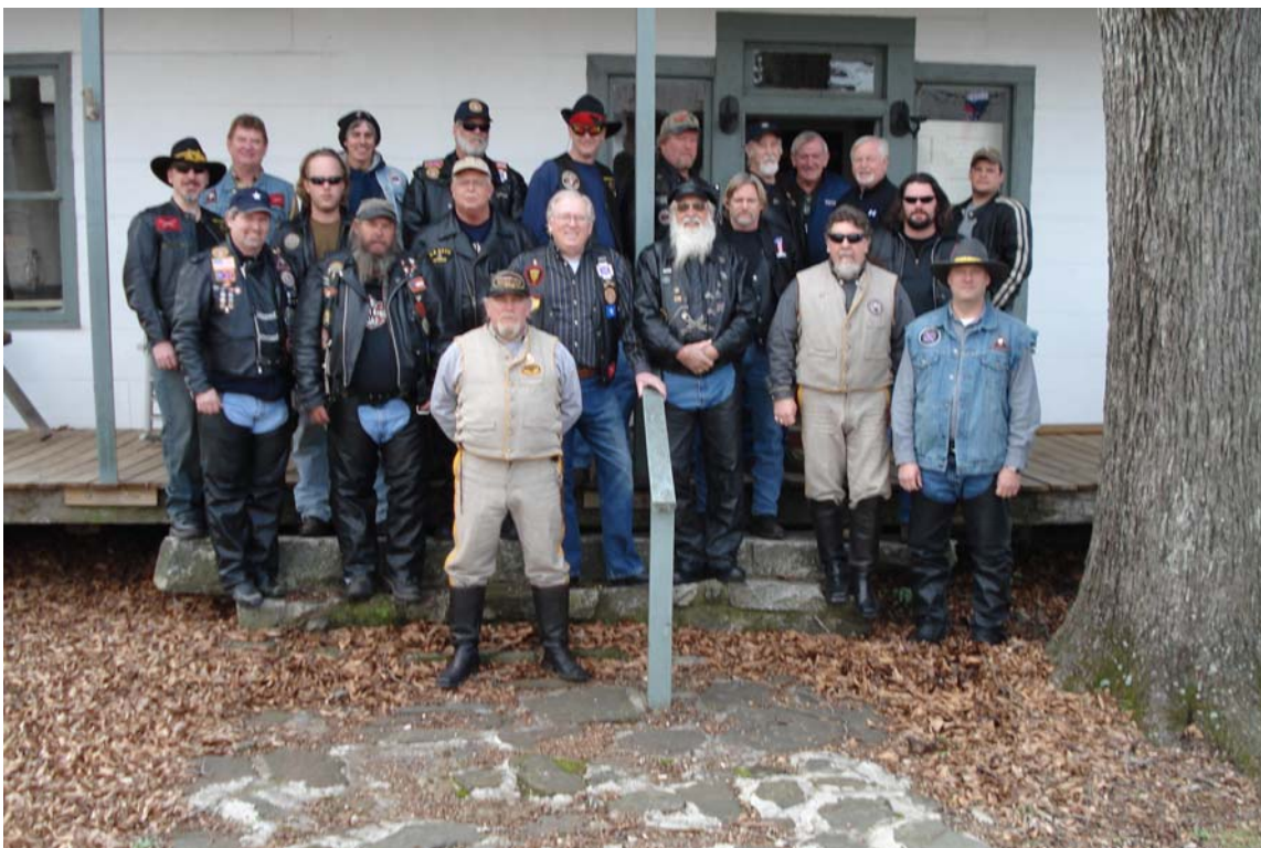
Georgia Mechanized Cavalry Quarterly meeting.