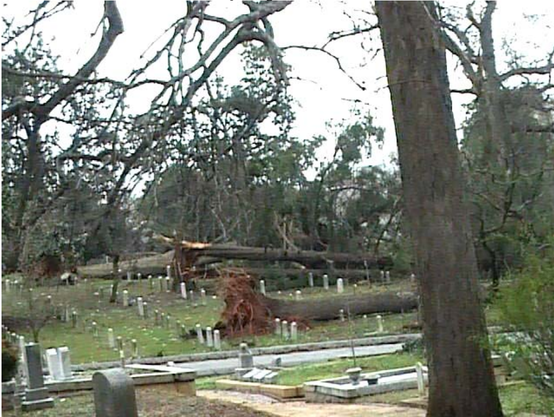
Tornado damage at the Oakland Cemetery in Atlanta.

The March 14 tornado that swept through Atlanta blazed a path right through the cemetery, uprooting towering trees, smashing gravestones and toppling monuments. And more than a week after the storm touched down on hallowed ground, its path is still easy to trace. Workers have removed some of the 86 trees – crape myrtles, magnolias and, yes, oaks – that were shattered by the storm. But much of the debris remains. Groundskeepers must wait for a federal evaluation – a requisite for getting federal help – before they start their work on any but the most essential repairs. The destruction begins with two fallen angels near the cemetery's western edge. The sculptures once perched on a memorial for Joseph E. Brown, Georgia's Civil War governor. A tall statue of a woman – perhaps Brown's wife – crashed to the ground, shattering into four pieces and tearing a foot-deep gash into the soil. From there the twister overturned obelisks and monuments that date back to 1850 and tore apart trees that were even older. Winds brought debris from across the city; a metal railing from a train station still blocks one path. Supporters worry that Oakland could be forgotten in the aftermath of the storm, which damaged other Atlanta landmarks and is believed to have killed one person as it cut a six-mile path through the city... Cleanup could cost millions. For one thing, there's no telling how difficult it will be to remove trees with roots entangled in caskets.