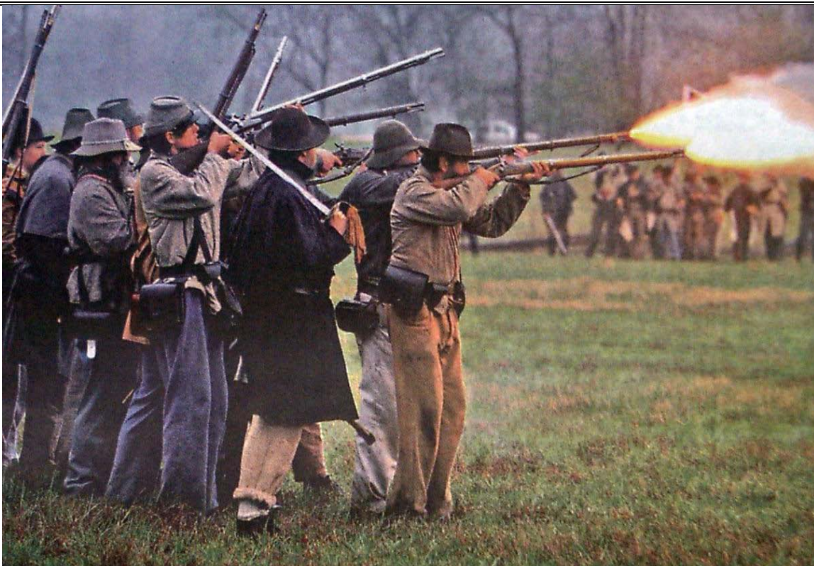
Siege of Bridgeport.2011