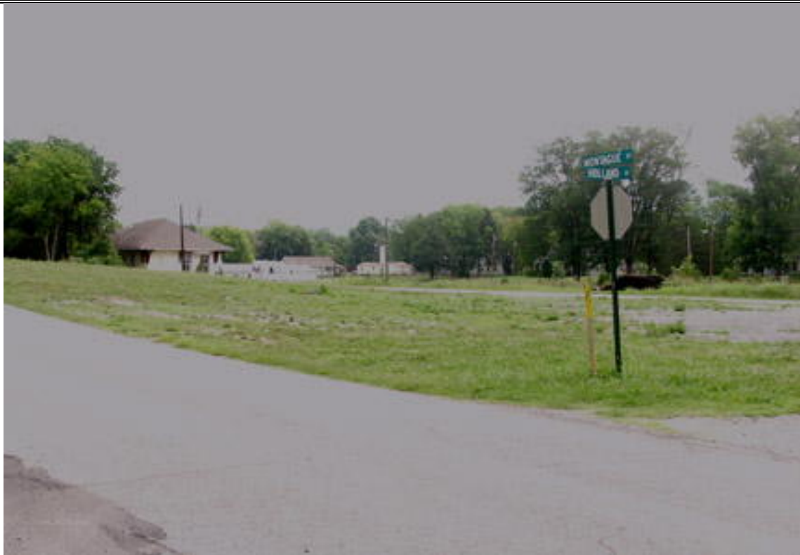
Site of the lynching in Trenton carried out by an all female lynching party. Recently recorded by Raymond Evans as a part of a survey project.