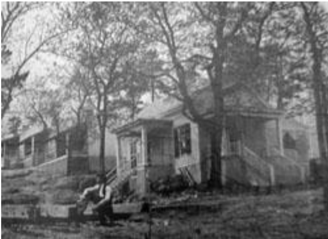
President Jefferson Davis' summer cottage on Lookout Mountain.