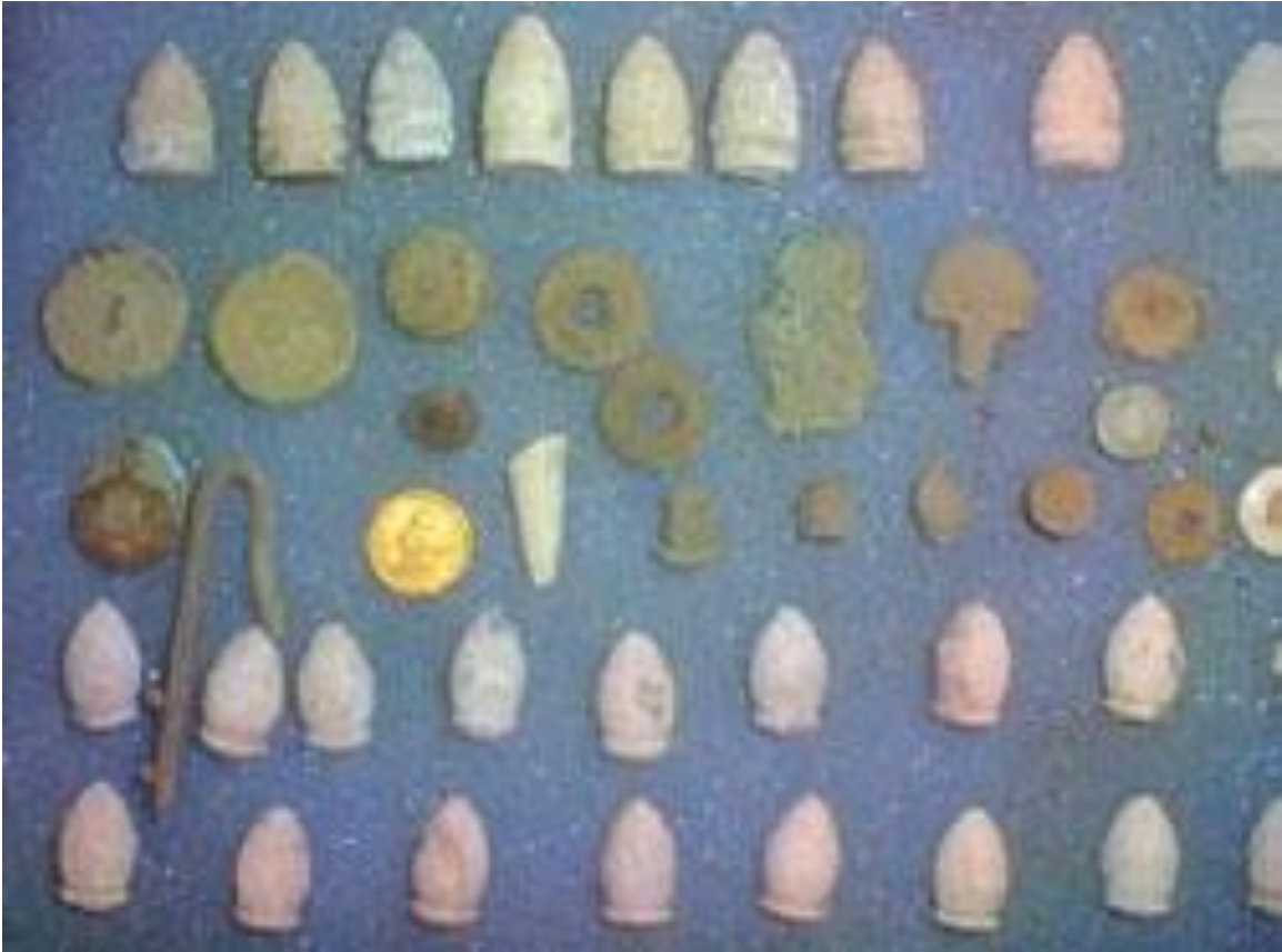
Some of the items that will be available at the show.

“I never know what these guys will come up with from show to show. They are like ‘American Pickers’ (a popular television show). They are out there constantly scouring the country for new things. That’s what makes it interesting,” he said. “But I know we’ll have a lot of antique firearms and a lot of antique swords and uniforms.”