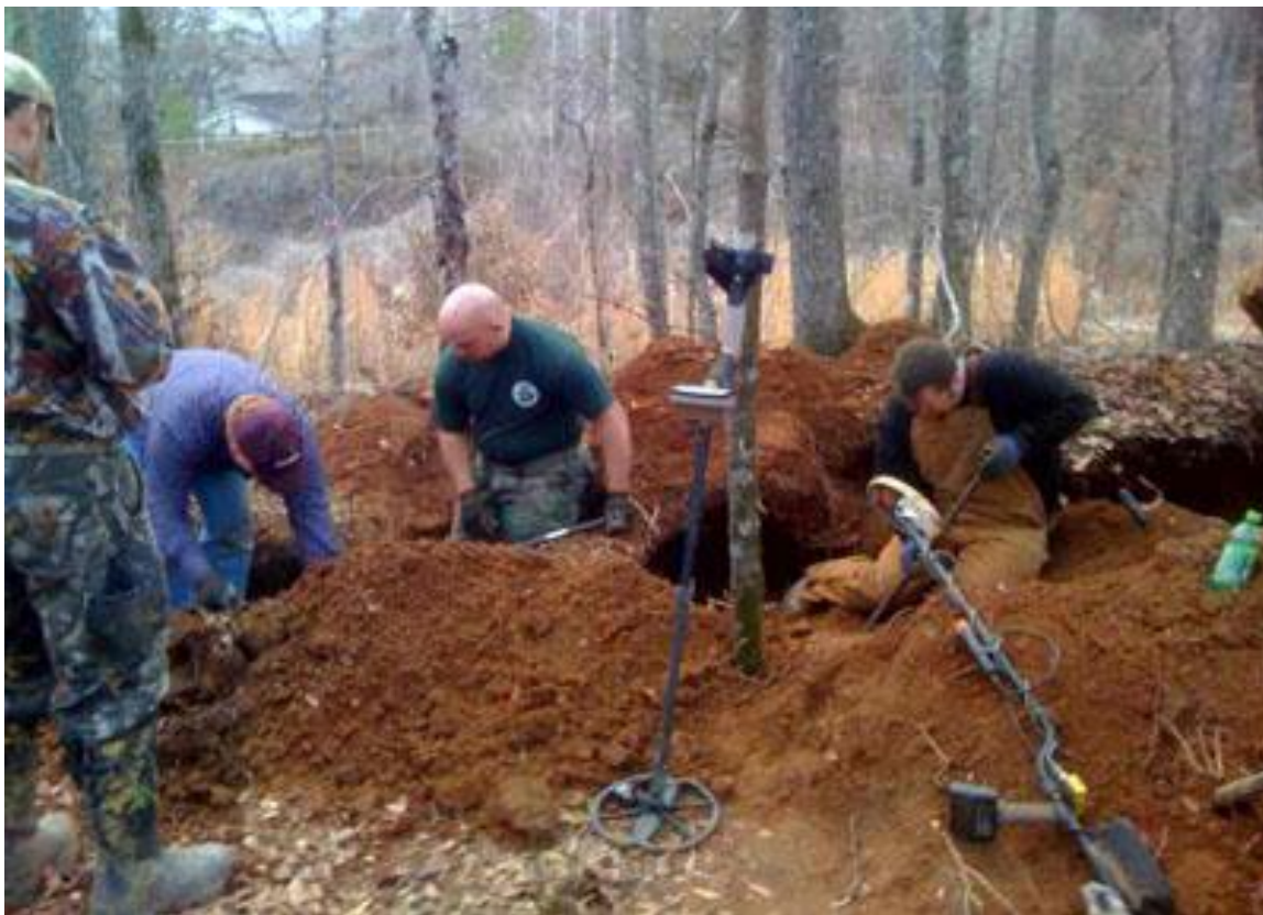
Finding materials for the Dalton Relic Show, February 4-5, 2012.