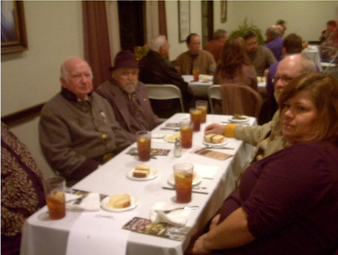
State of Dade Table at the Lee Jackson Dinner.