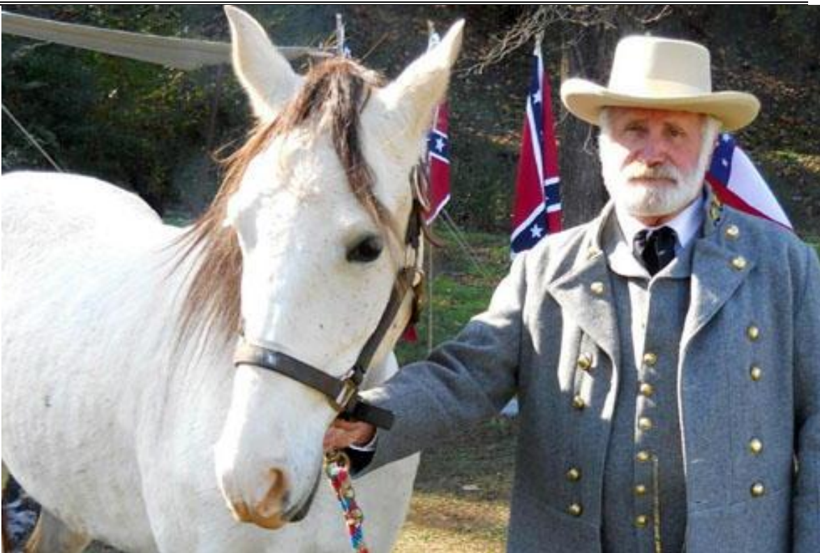
Re-enactor portraying Robert E. Lee with Traveler.