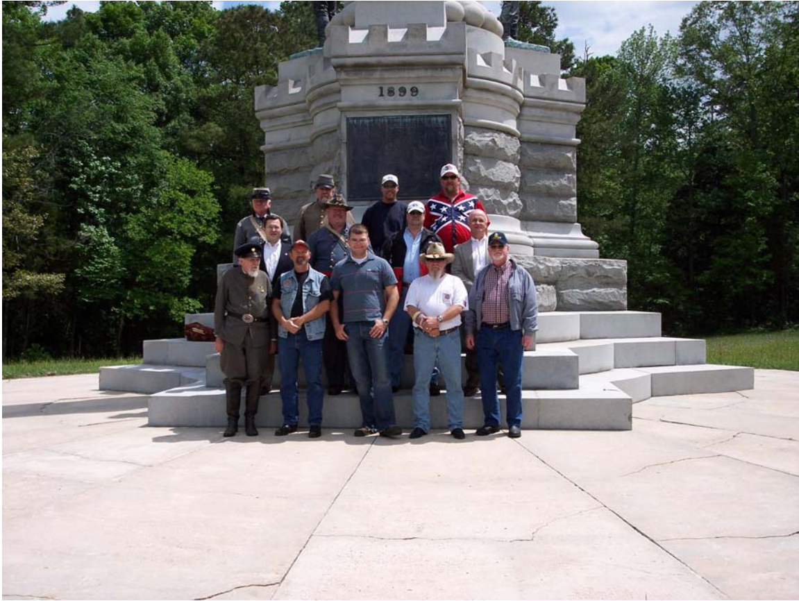
State of Dade Camp 707 participating in Memorial Day observations at the Georgia Monument in Chickamauga Chattanooga National Military Park – 2006.