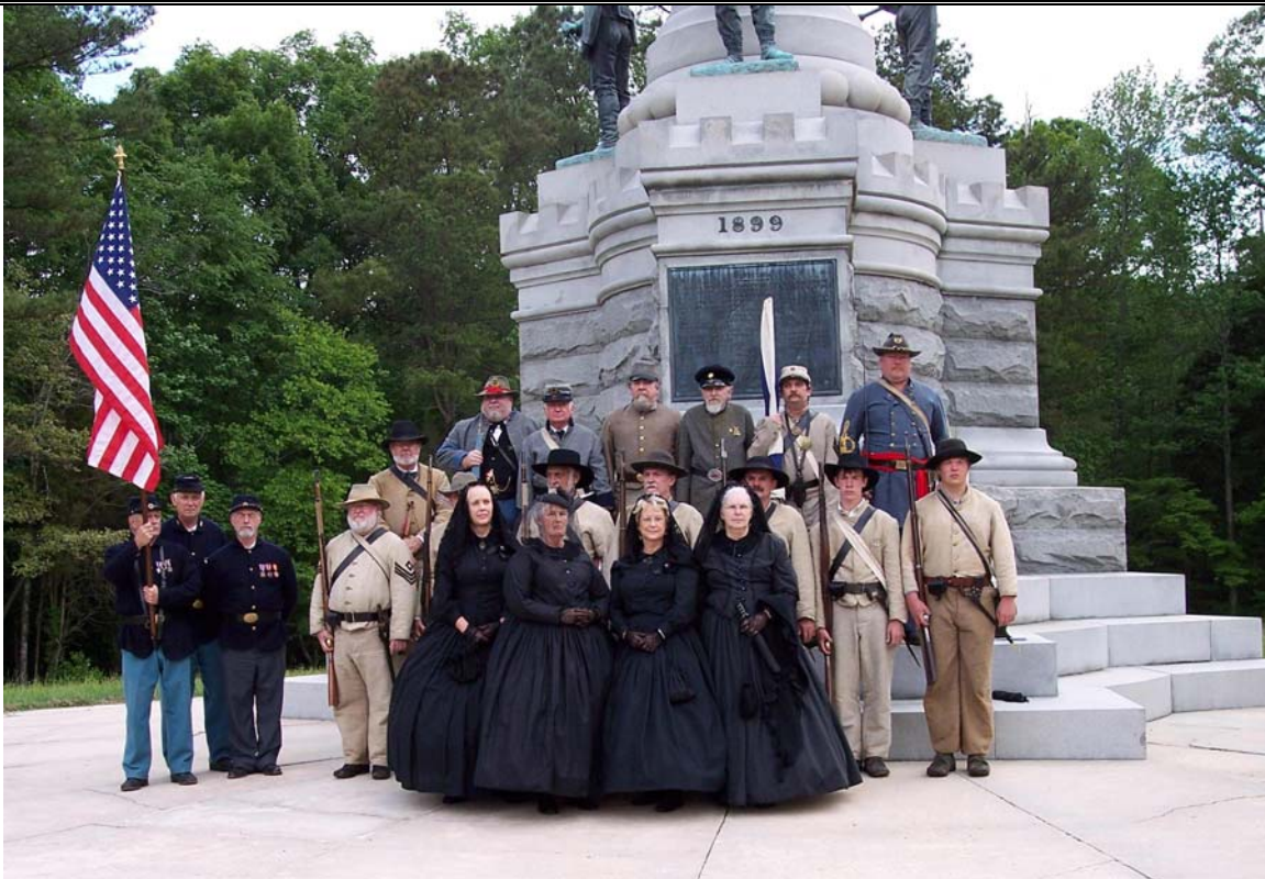
Confederate Memorial Day 2006.