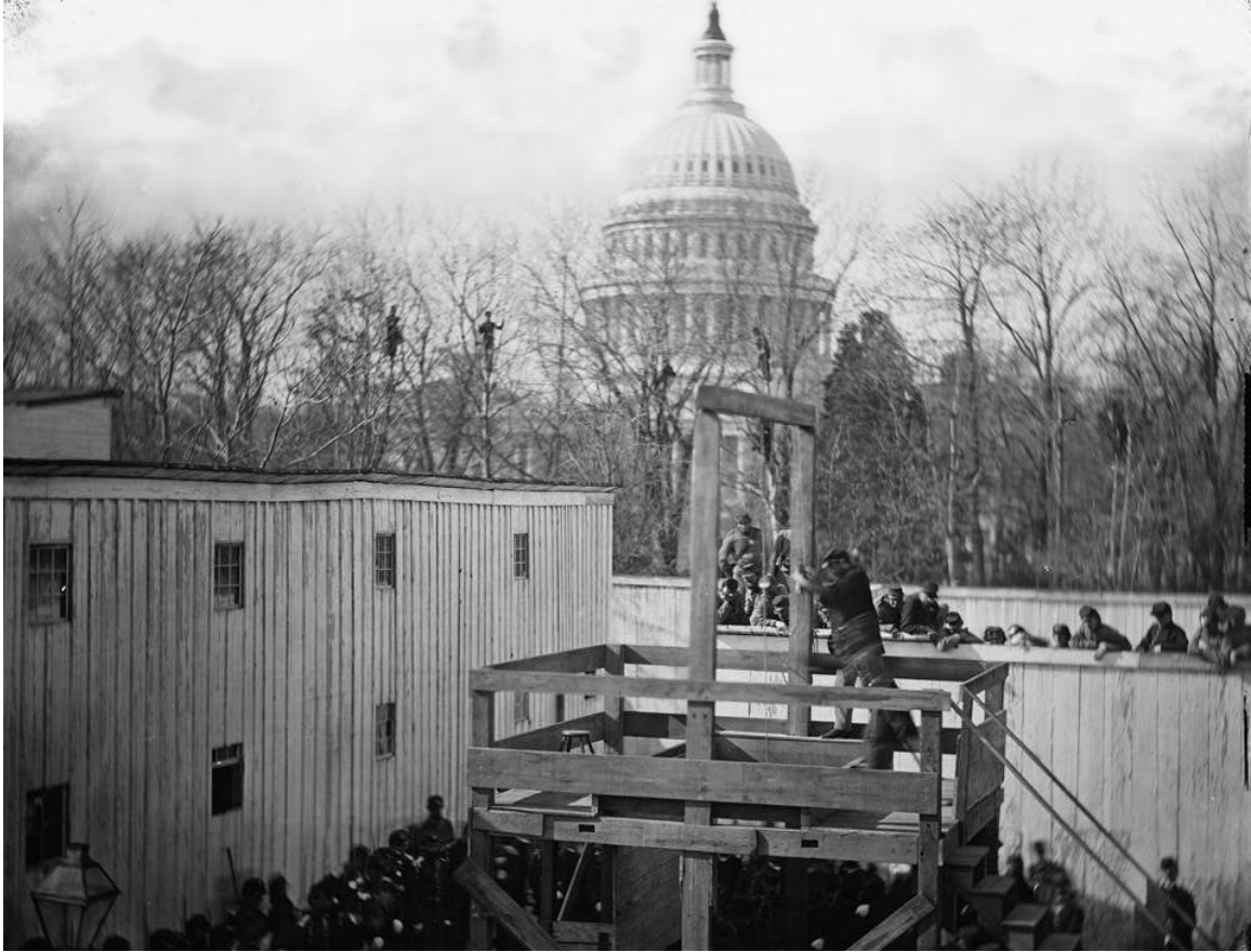
The execution of Captain Henry Wirz.

Captain Henry Wirz was unfairly charged of war crimes and it is written that no witnesses for the defense were allowed to testify. Among those who would have is that of a Union soldier who was a prisoner at the prison.