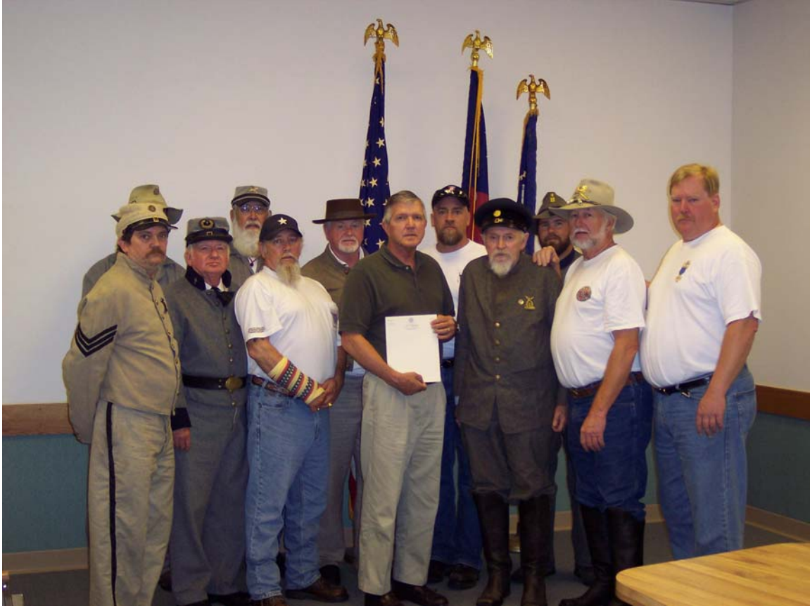
Mayor Emanuel issuing Confederate Heritage Month Proclamation for Trenton.

During the first week of April, we flew the First National Confederate Flag, known as “The Stars and Bars” on our flag pole at the Confederate Monument in Dade County’s Veterans Park. During the second week, we flew the Second National Confederate Flag, known as “The Stainless Banner.” During the third week, we flew, the Third National Confederate Flag, known as “The Flag of No Surrender.” During the final week of April we flew the Confederate Battle Flag, known as “The Southern Cross.” Each week the local paper covered the changing of the flag and did an article describing the flag used during that week..