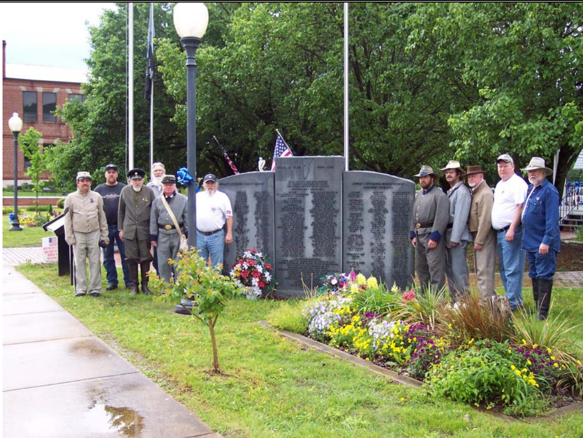
State of Dade Camp 707 celebrating Confederate Memorial Day 2006 in Trenton.