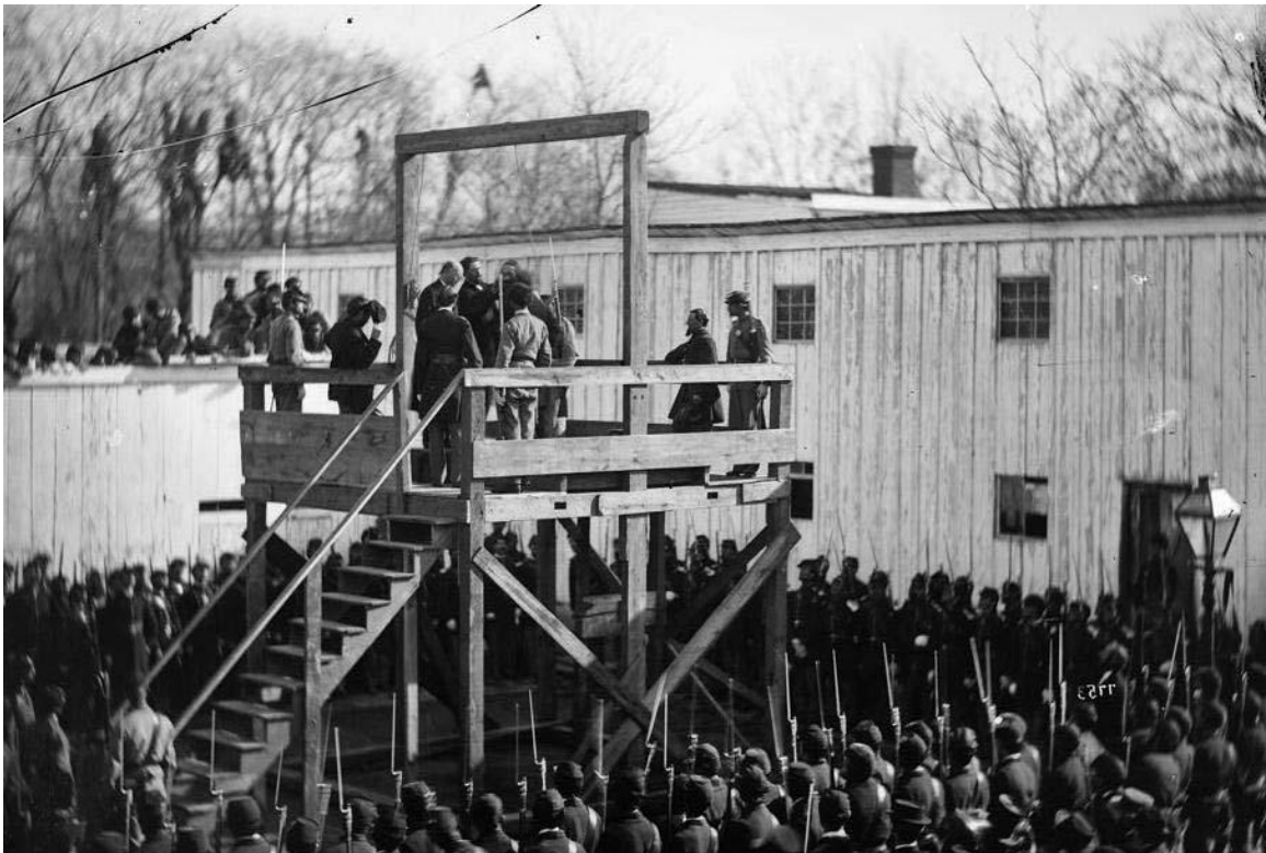
Captain Wirz on the gallows.

The Confederacy sent a distress message to Union President Abraham Lincoln and Union General Ulysses S. Grant. The South pleaded for an exchange of Confederate and Union prisoners. Lincoln and Grant, however, refused believing the Union prisoners might go home but the Confederate prisoners might go back to fight.