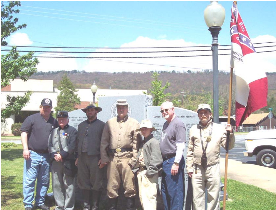
Confederate Memorial Celebration at Trenton, Georgia – 2007.