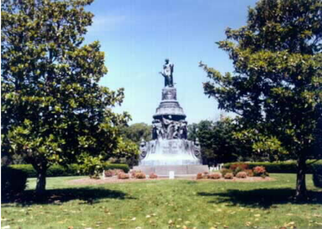
Confederate Monument at Arlington National Cemetery.

Ezekiel was not able to come to the dedication of the monument held on June 4, 1914, with President Woodrow Wilson presiding. Many Union and Confederate soldiers were in attendance among the crowd of thousands. Moses Jacob Ezekiel studied to be an artist in Italy. As a tribute to his great works, he was knighted by Emperor William I of Germany and King's Humbert I and Victor Emmanuel, II of Italy – thus the title of "Sir." Among the works of Sir Moses J. Ezekiel are: "Christ Bound for the Cross", "The Martyr", "David Singing his song of Glory" and "Moses Receiving the Law on Mount Sinai."