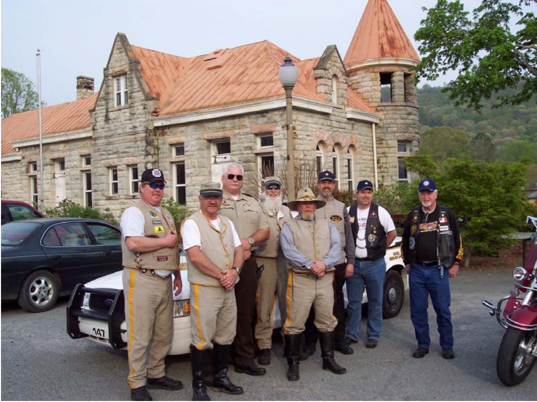
State of Dade Camp members visit with Alabama law enforcement.