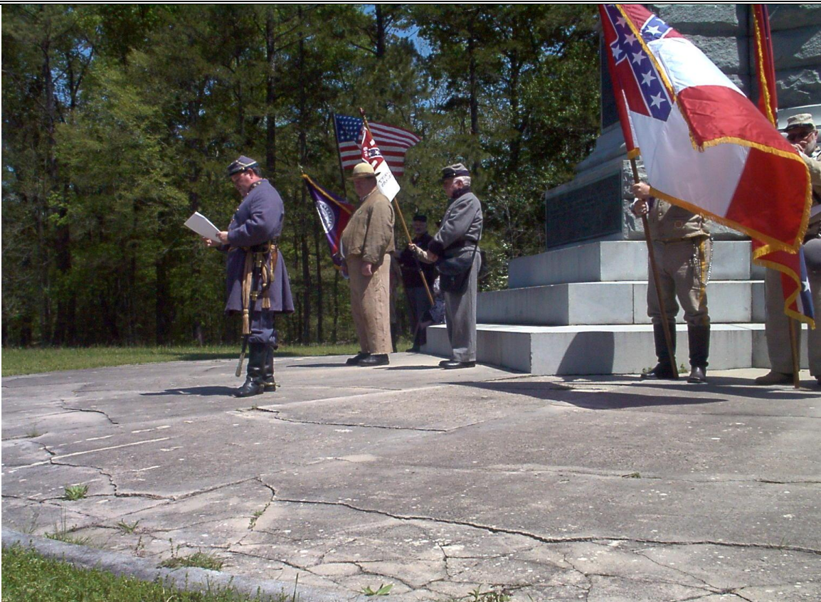
Eleventh Annual Confederate Memorial Day at the Georgia Monument.