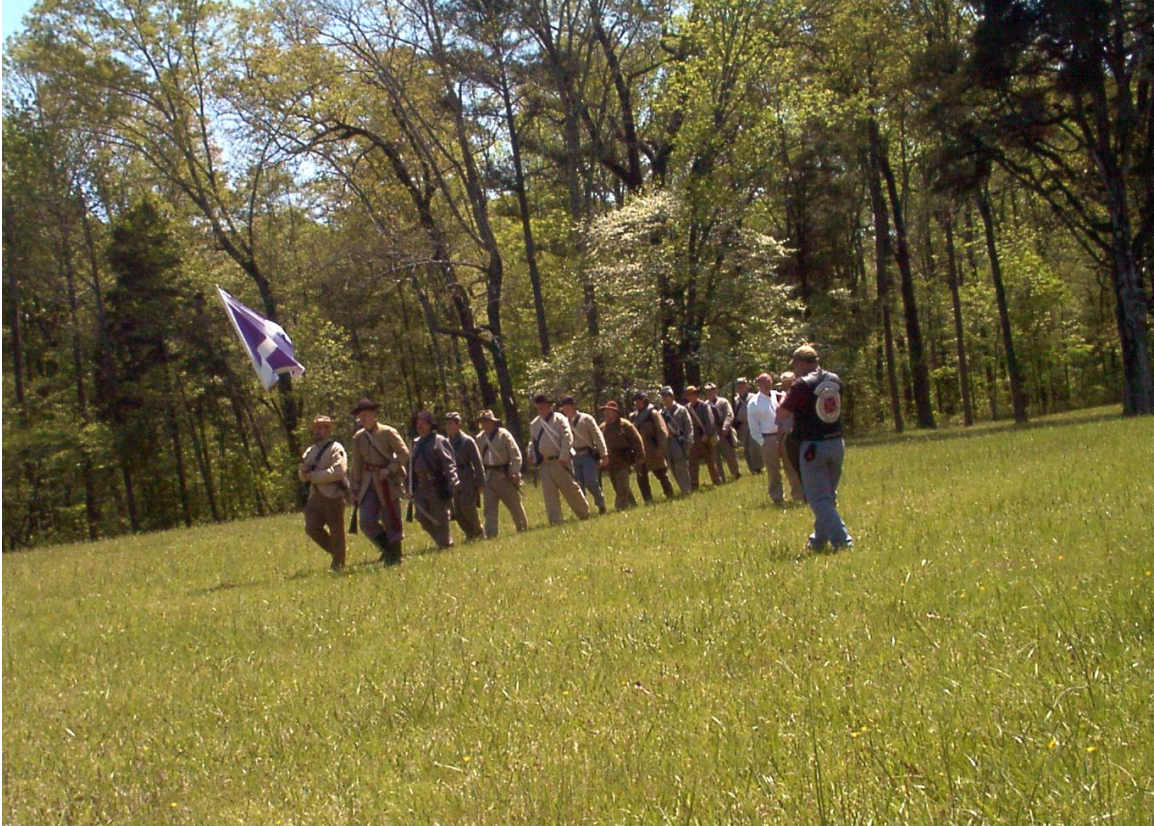
Honor Guard at the Georgia Monument.