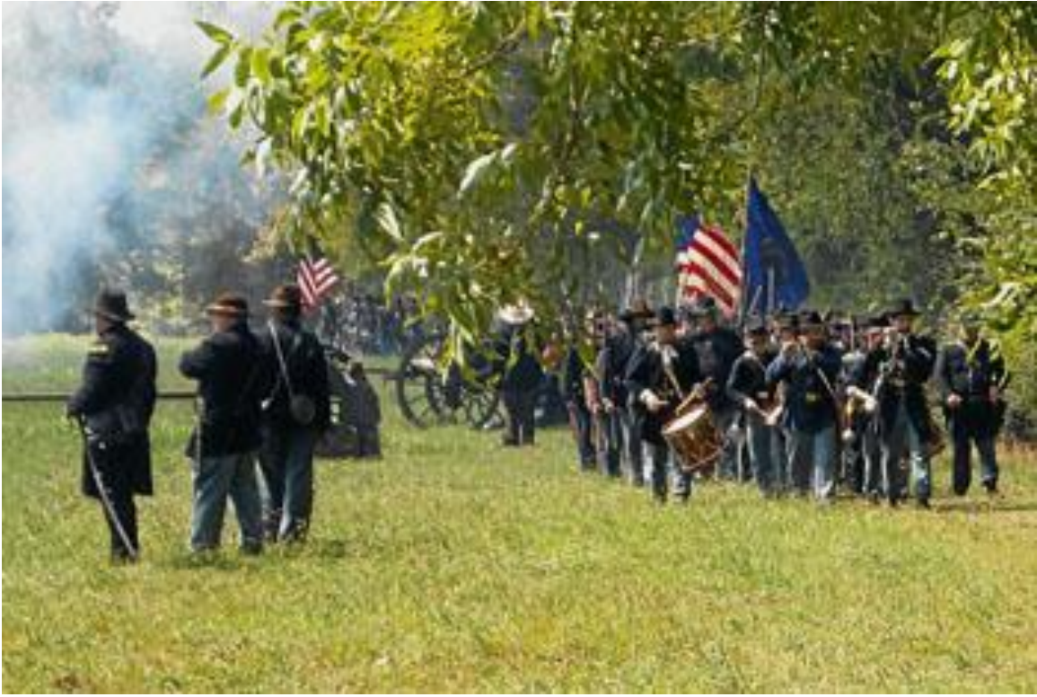
The arrival of the Federal Army at Tunnel Hill.