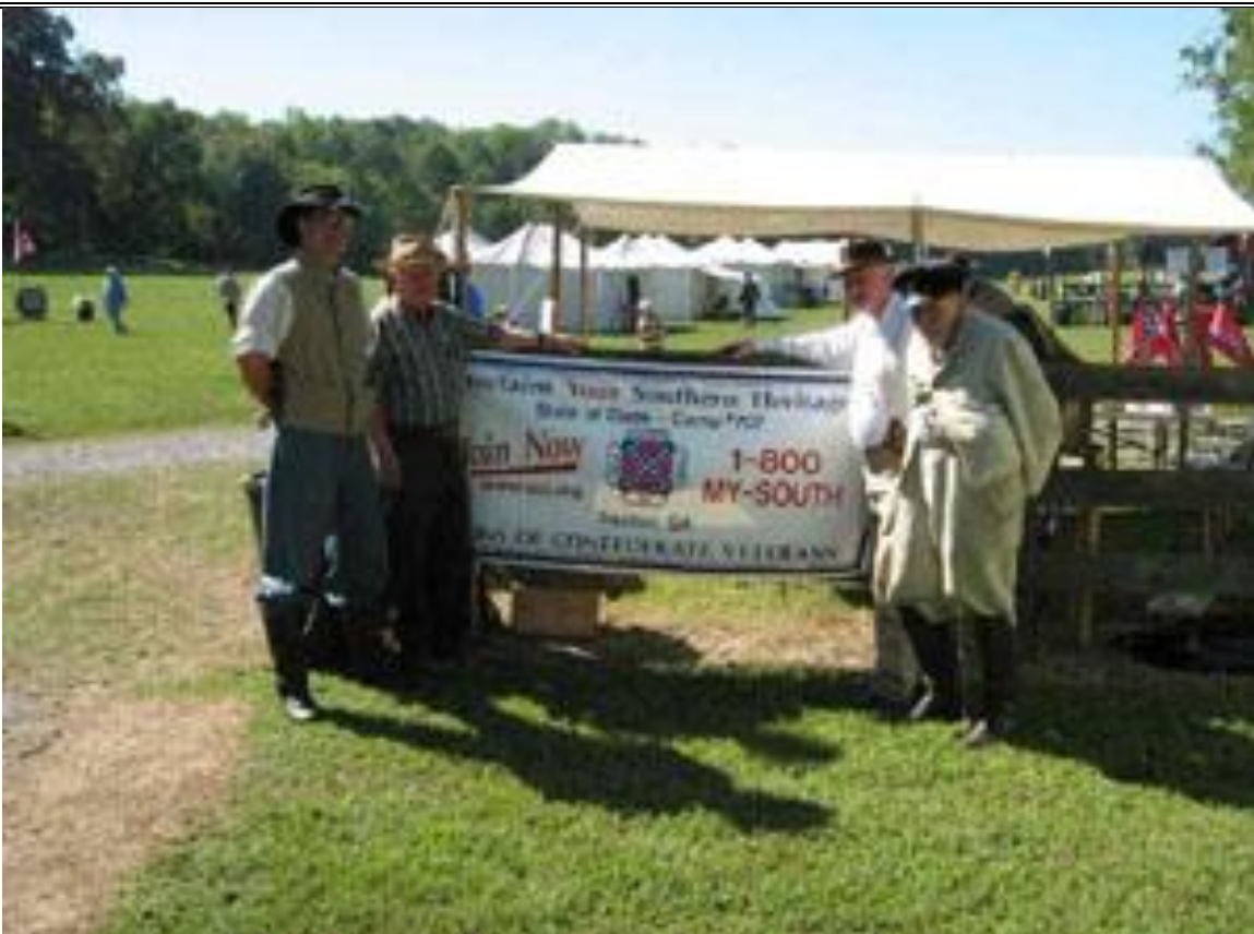
State of Dade Booth at Tunnell Hill.