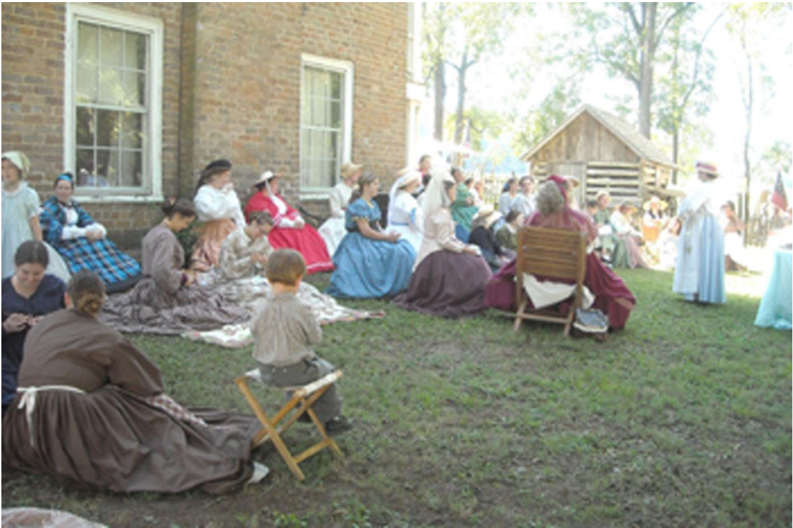
Special event at Tunnel Hill.